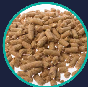
Maize gluten feed pellets