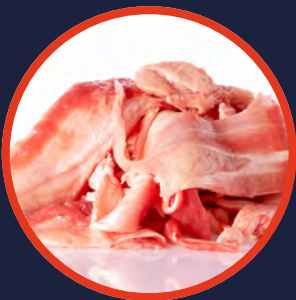
Hides and skins