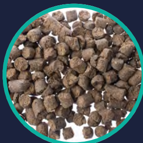
Brewers' grains pellets