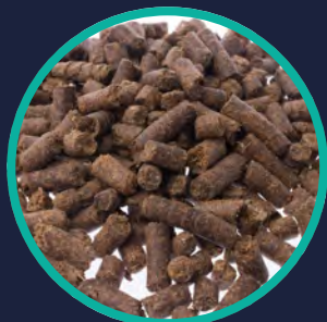
Dried distillers grains