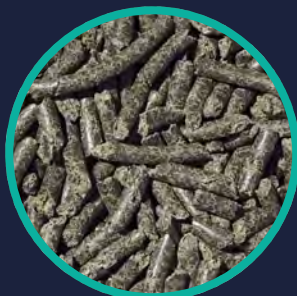
Sunflower oil cake pellets