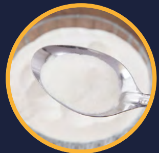
Collagen hydrolysate (collagen peptide)