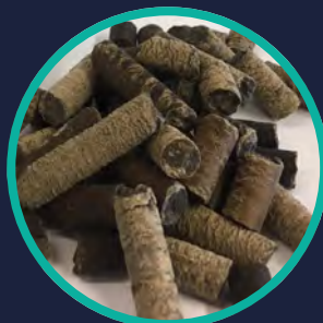
Microbial biomass granules