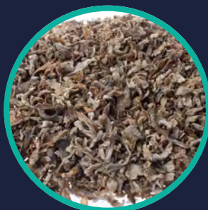
Sugar beet pulp