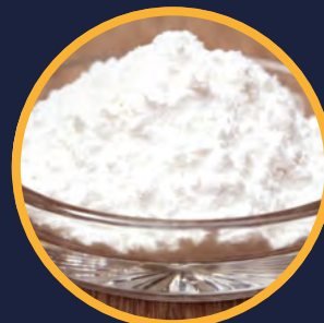
Food and feed additives