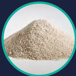
Spray-dried blood plasma