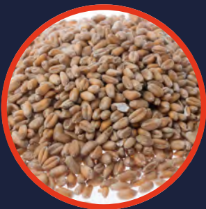
Whole wheat grain