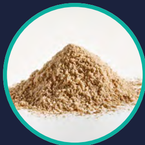
Processed animal protein