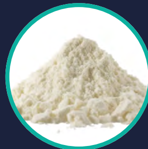
Skimmed milk powder