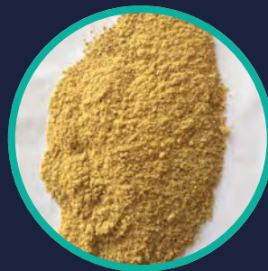
Gelatine process derived proteins