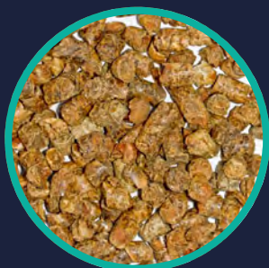
Dried citrus pulp pellets