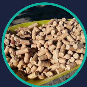
Processed former foodstuffs